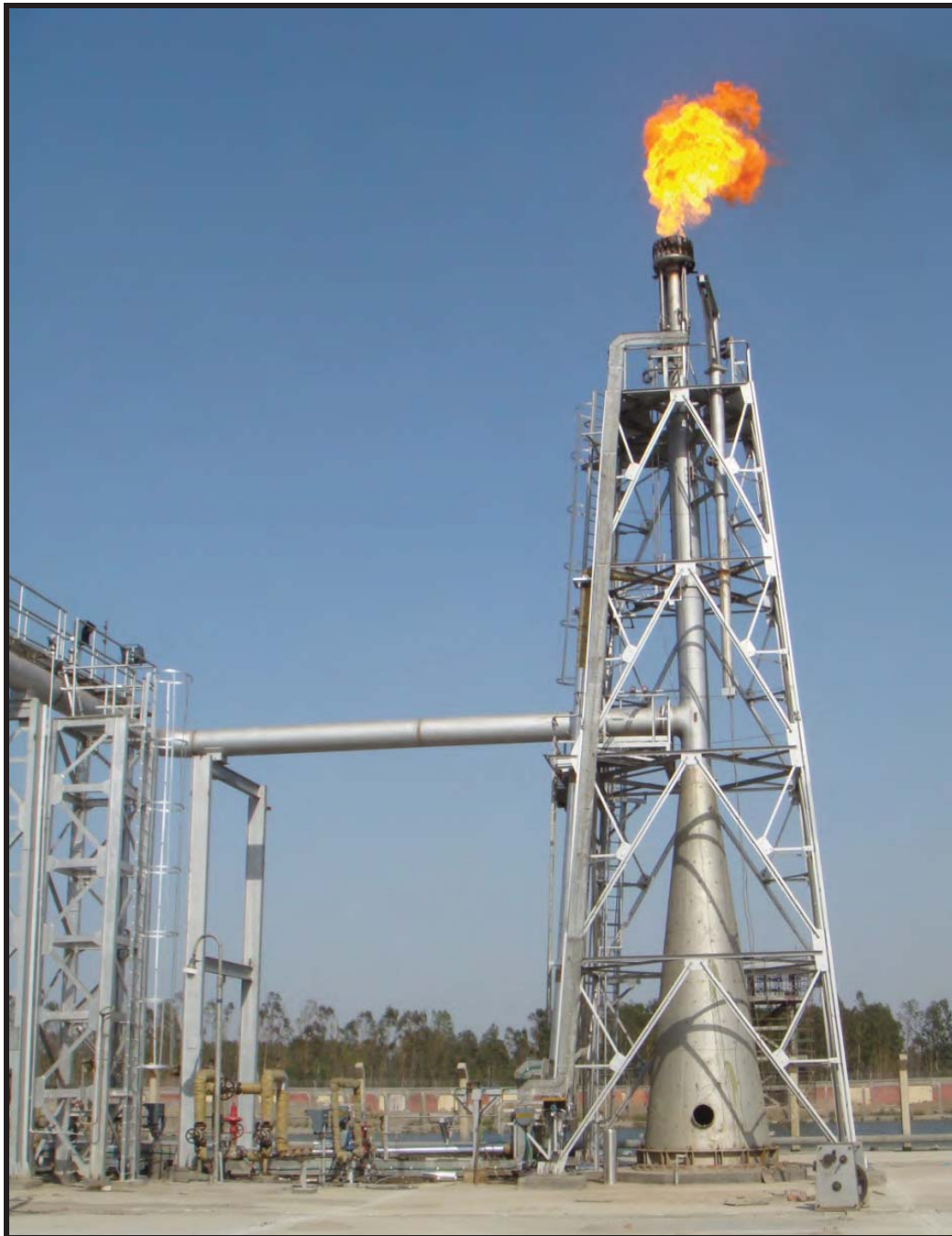
LP HC Flare (24" dia. x 20m high) at IOCL Panipat Refinery, Panipat Naphtha Cracker Project (EPCC-9)