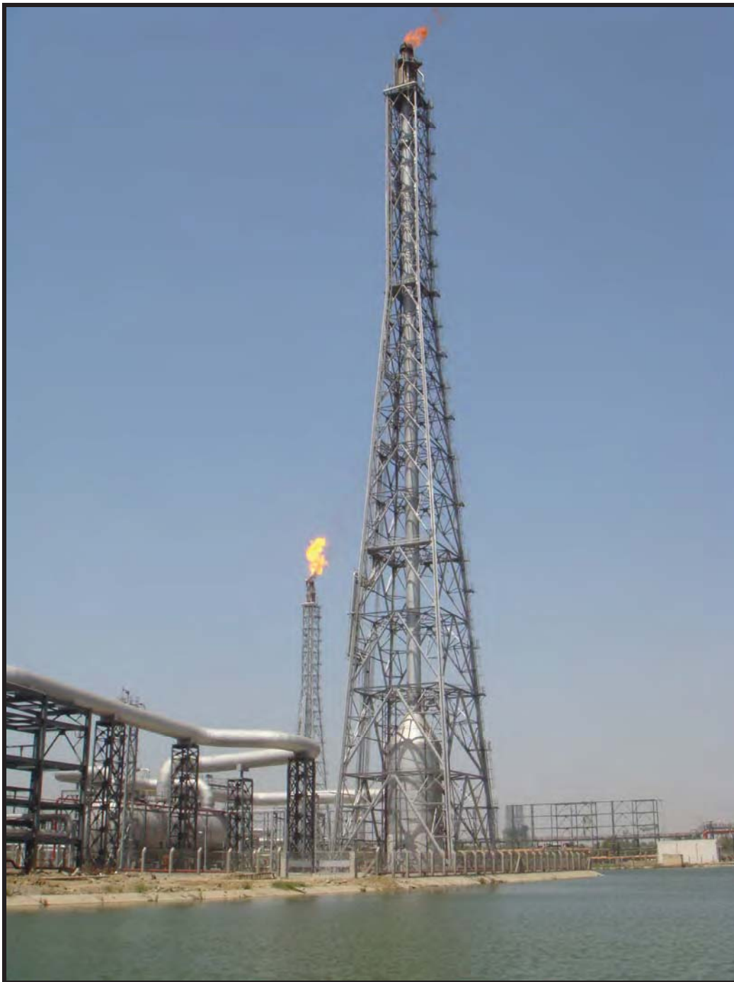
Flares in operation: 76" dia. X 130m Polymer+MEG Flare in front side AND 72" dia. x 119m NCU HC + Sour Flares in back side at IOCL Panipat Refinery, PNCP (EPCC-9)