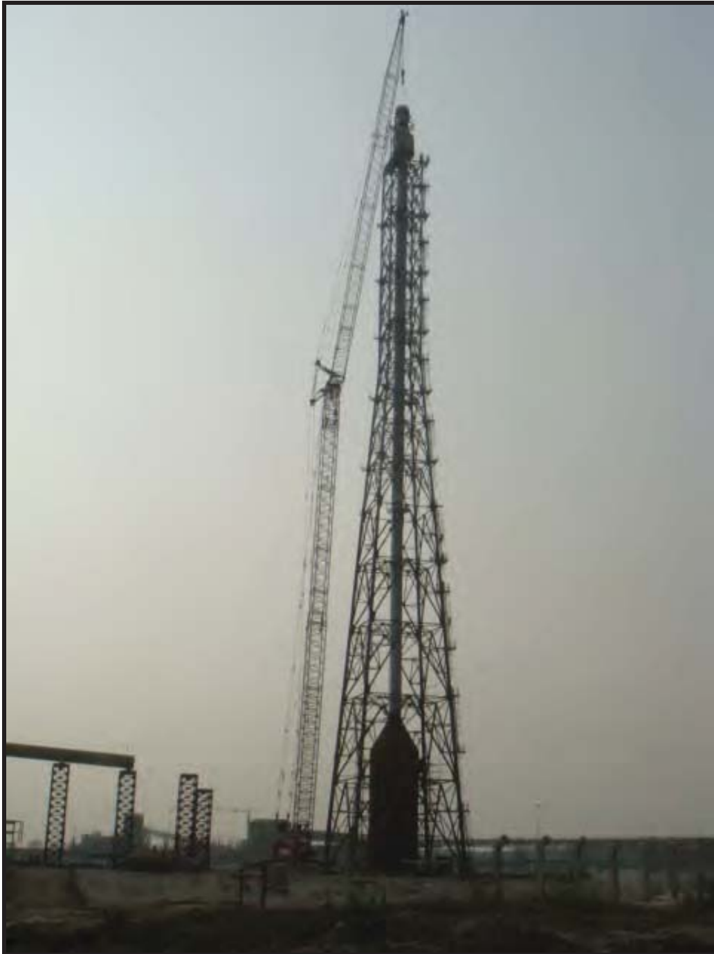
Erection (In-progress) of 72" dia. x 119m NCU HC Flare at IOCL Panipat Refinery, Panipat Naphtha Cracker Project (EPCC-9)